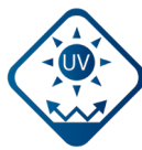
Compact & Robust UV Resistant Housing