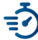
Fast Custom Turnaround Time