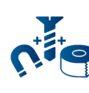
Flexible Mounting Options