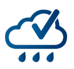
Full Outdoor Installation Ready