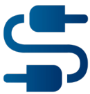
Low Loss Cable Accessories